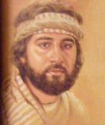
Judas (also called Thaddaeus)

an apostle. Do you know his name?— It was Matthias. Later, Paul and Barnabas also became apostles, but they were not part of the 12.—Acts 1:23-26; 14:14.