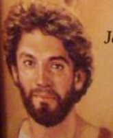
James (son of Alphaeus)